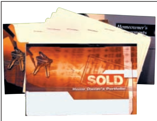
Index dividers or folders can be inserted to organize materials