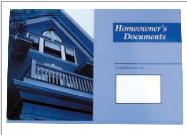
High gloss, full color covers command attention.